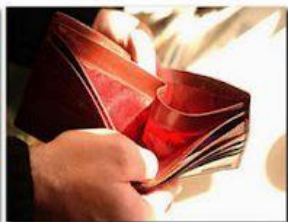
After Valentine's Day