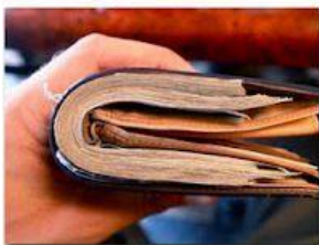
Before Valentine's Day